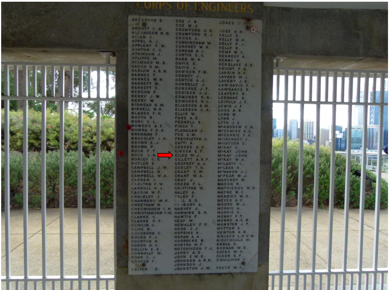
Corps of Engineers Panel