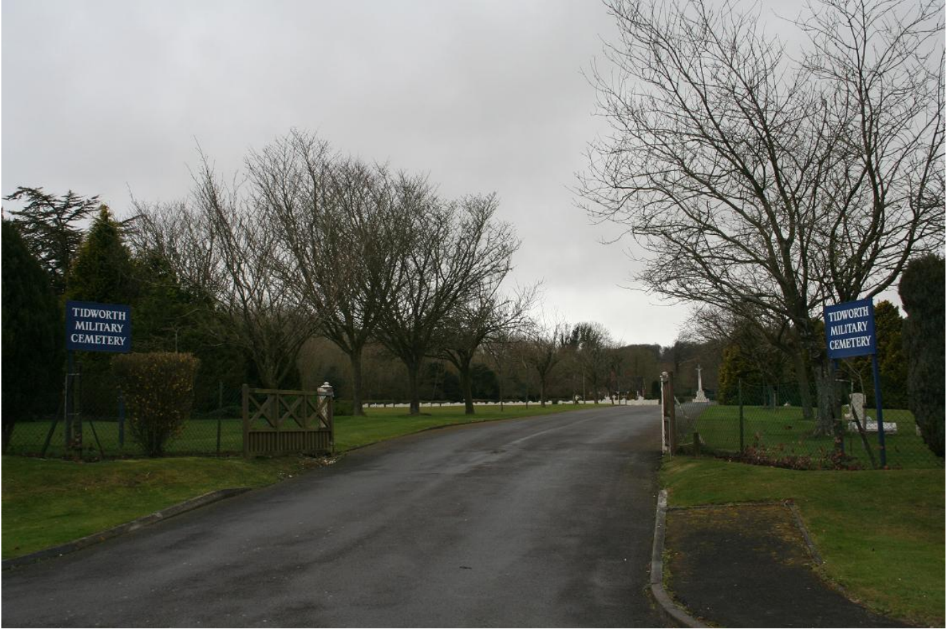
Tidworth Military Cemetery